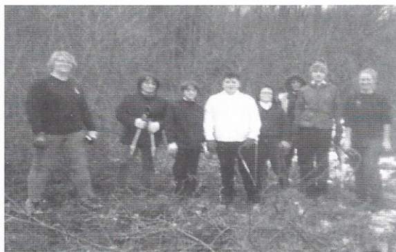
Clearing scrub and brambles on the Scrambles.