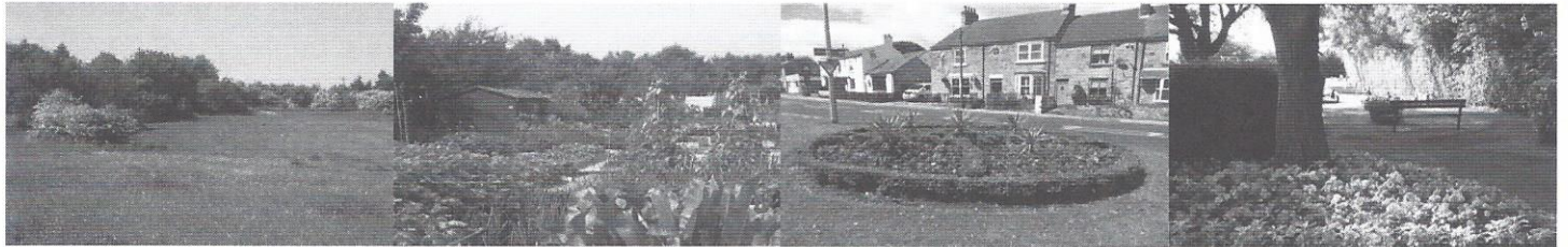
Some of the Winning Entries in this year's Northumbria in Bloom Competition

These have been our best results so far and are testament to the hard work and enthusiasm of all those involved – Congratulations to everyone who took part!